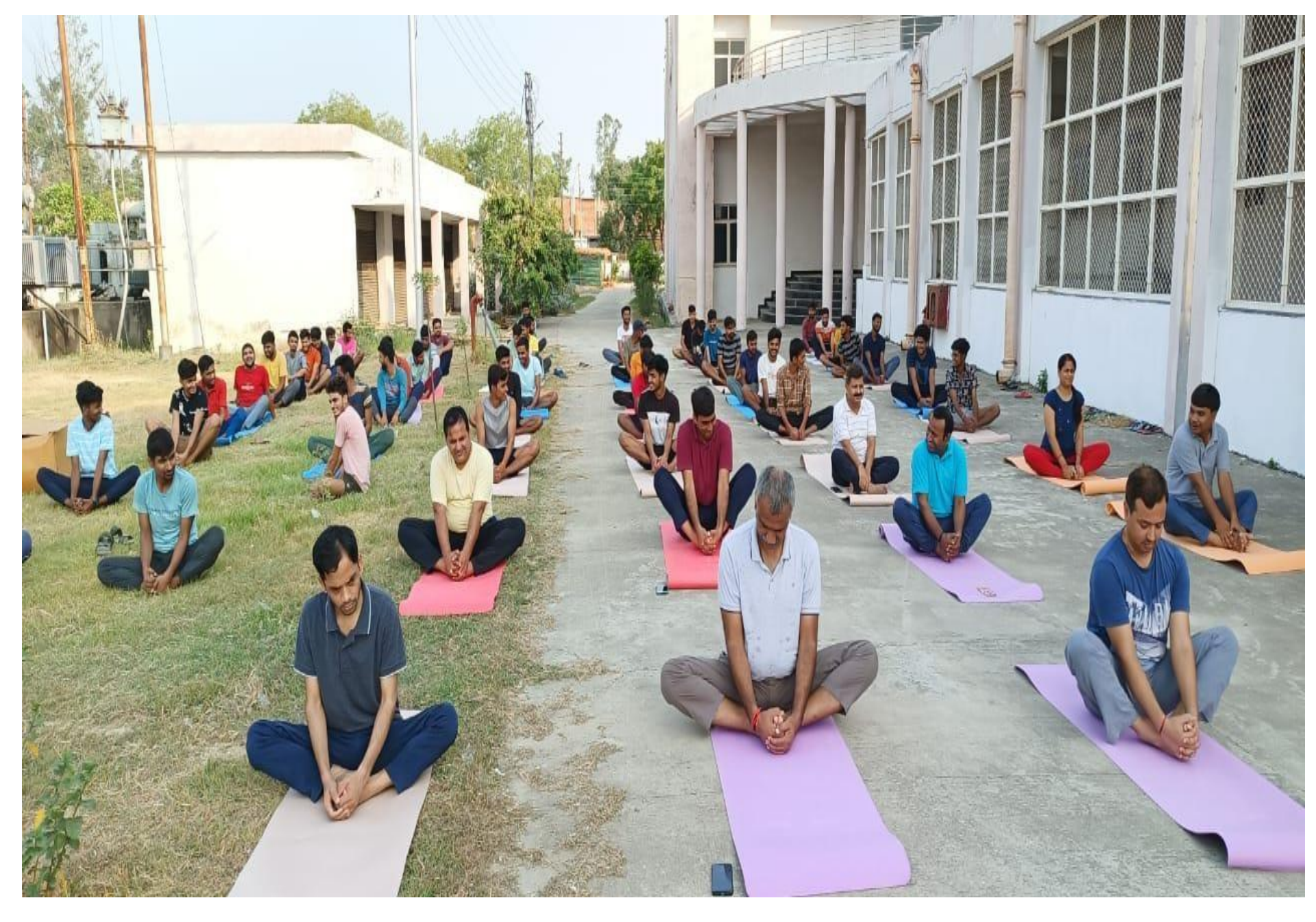
Celebration of International Yoga Day, 21st June, 2019 (Azamgarh Campus)