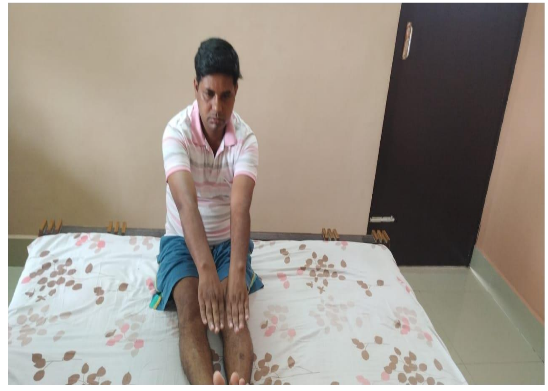
Yoga practice at Home on 21st June, 2021 during COVID-19 pandemic