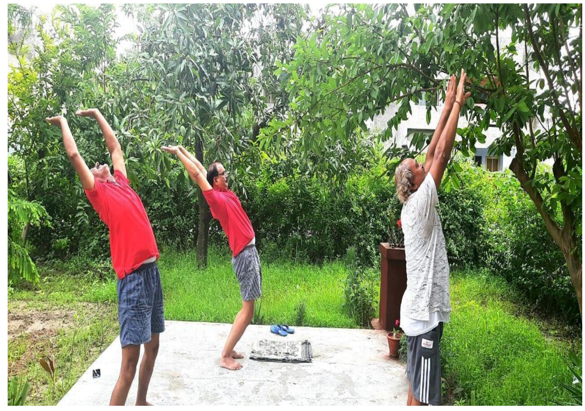
Yoga practice on 21st June, 2020 during COVID-19 pandemic