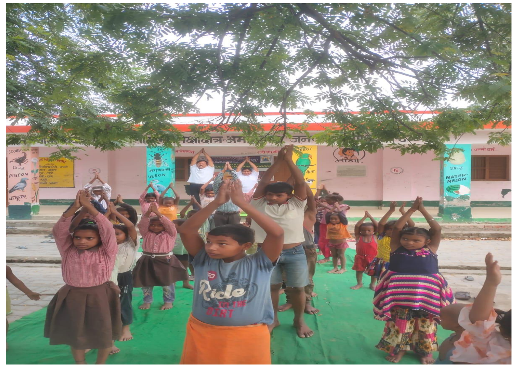
Yoga training at Barauli Jham village adopted by the University on International Yoga Day