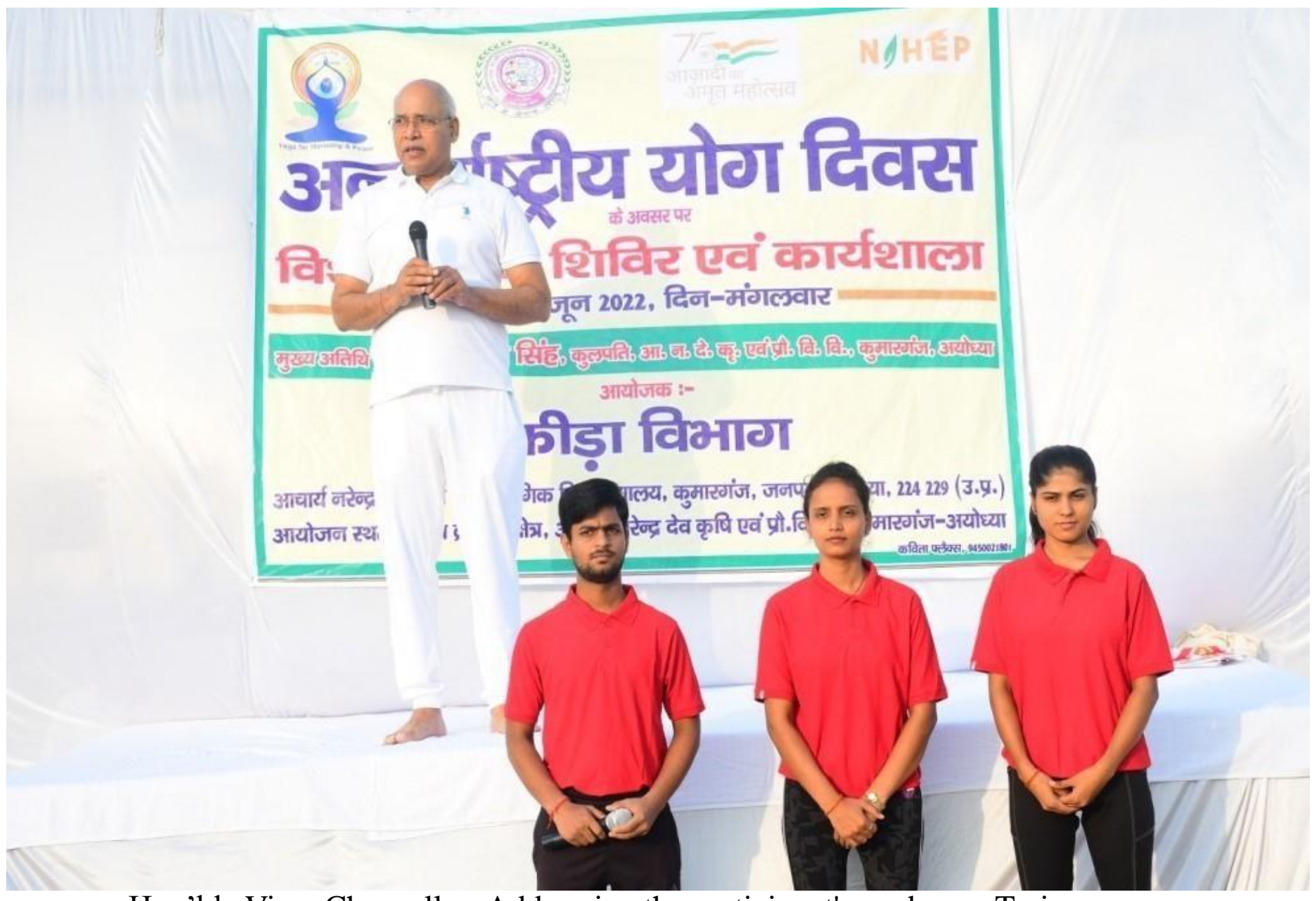
Hon'ble Vice- Chancellor Addressing the participant's and yoga Trainers (Yoga Day, 21st June, 2022)