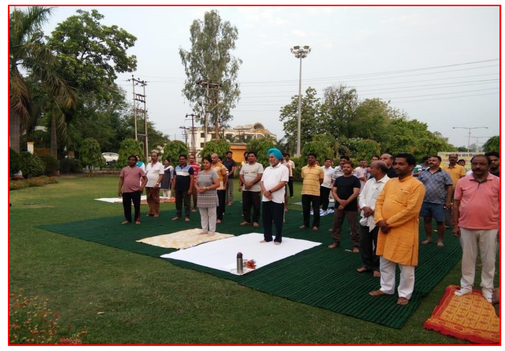
Celebration of International Yoga Day, 21st June, 2019