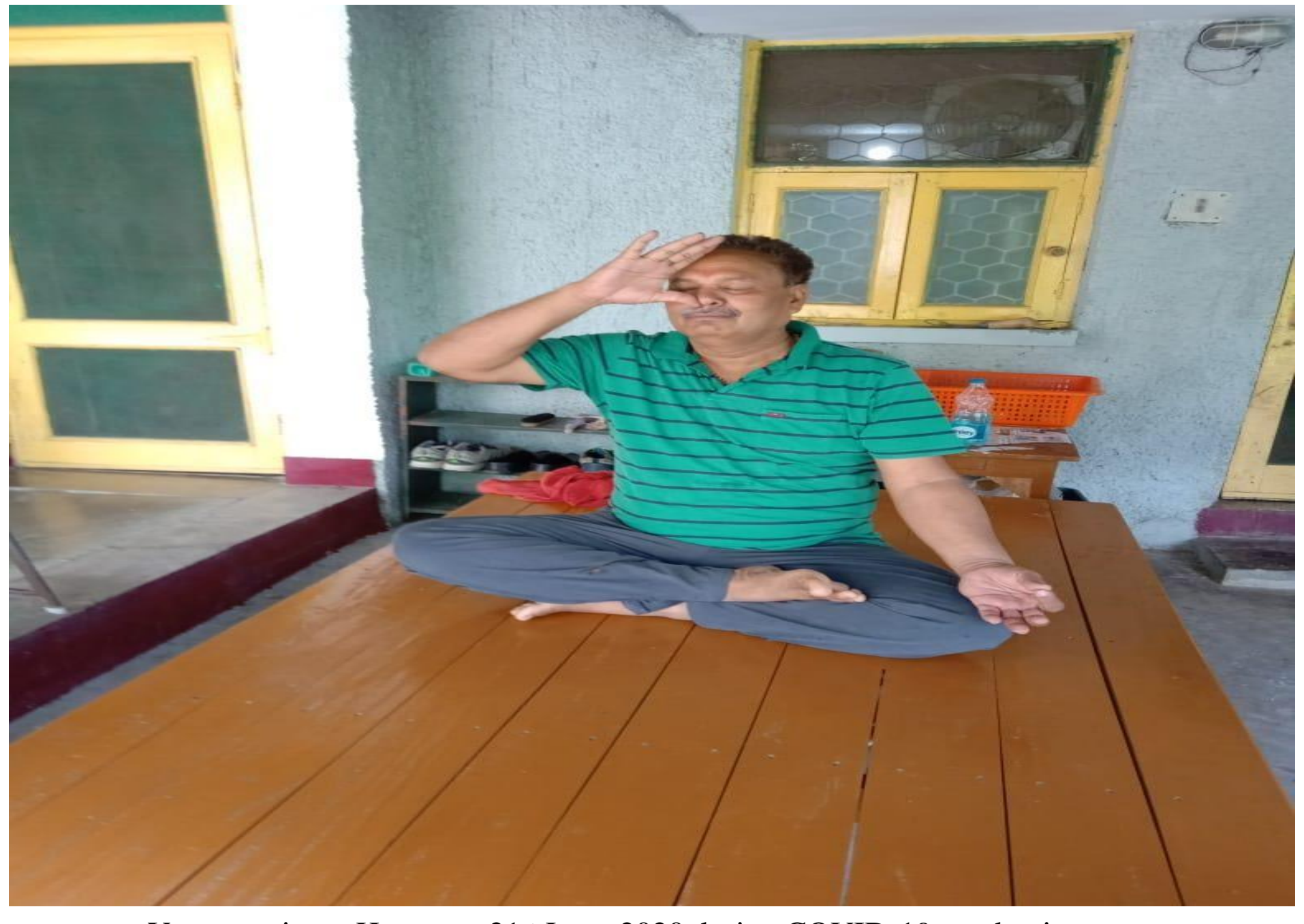
Yoga practice at Home on 21st June, 2020 during COVID-19 pandemic