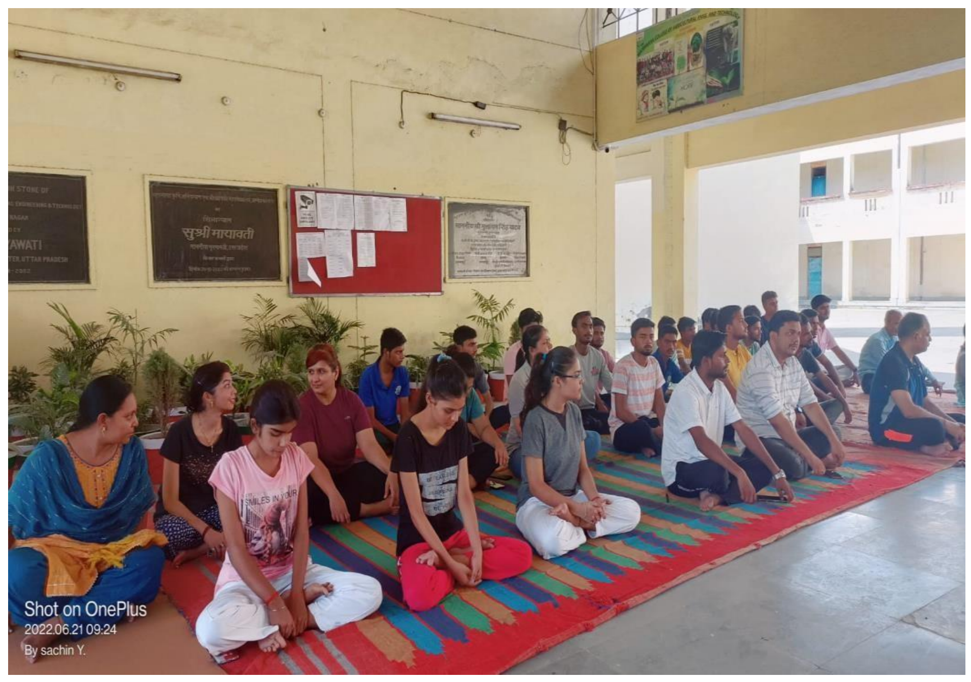
Celebration of International Yoga Day, 21st June, 2019