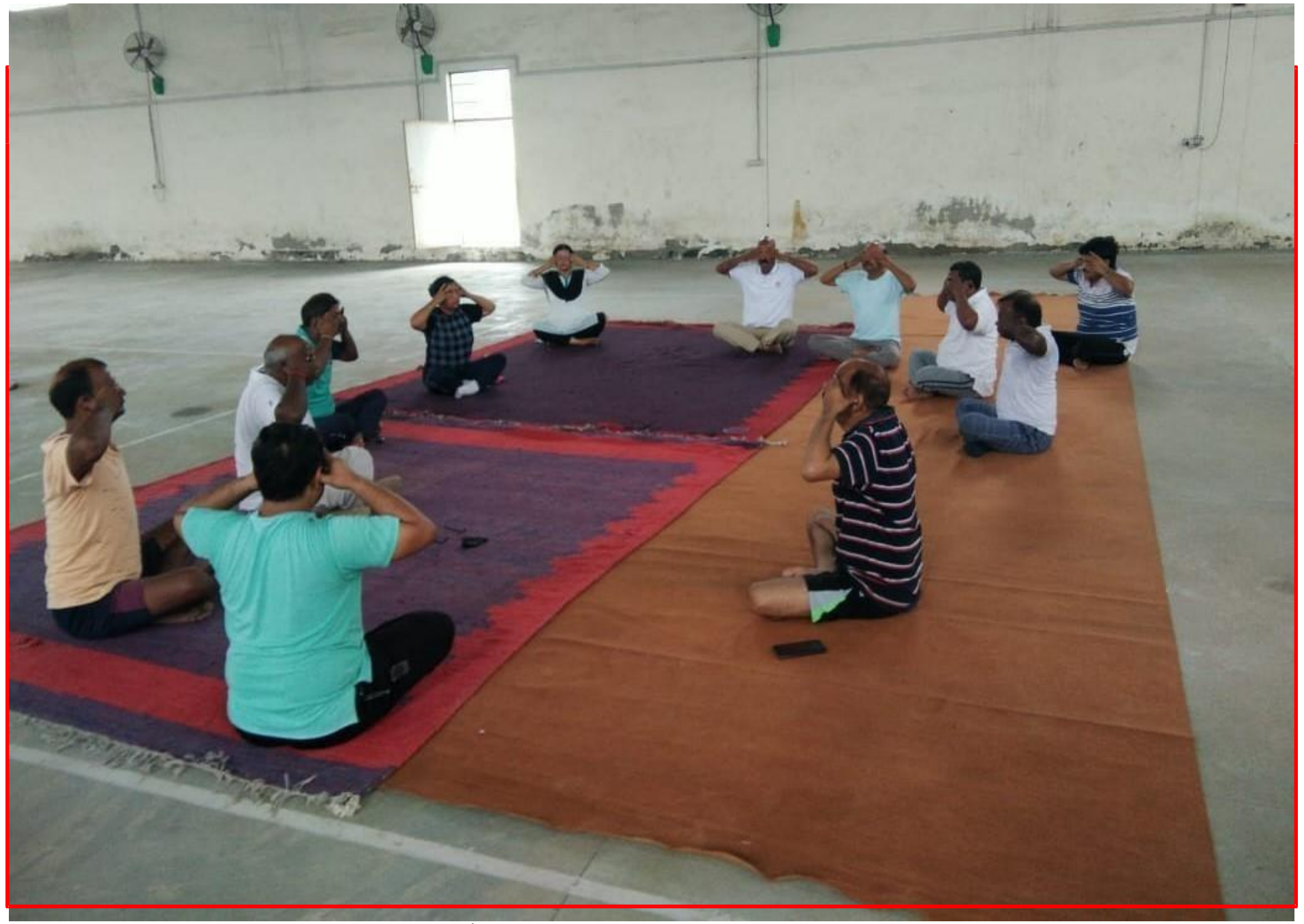
Yoga Practice on 20<sup>th</sup> June, 2021 during COVID-19 Pandemic