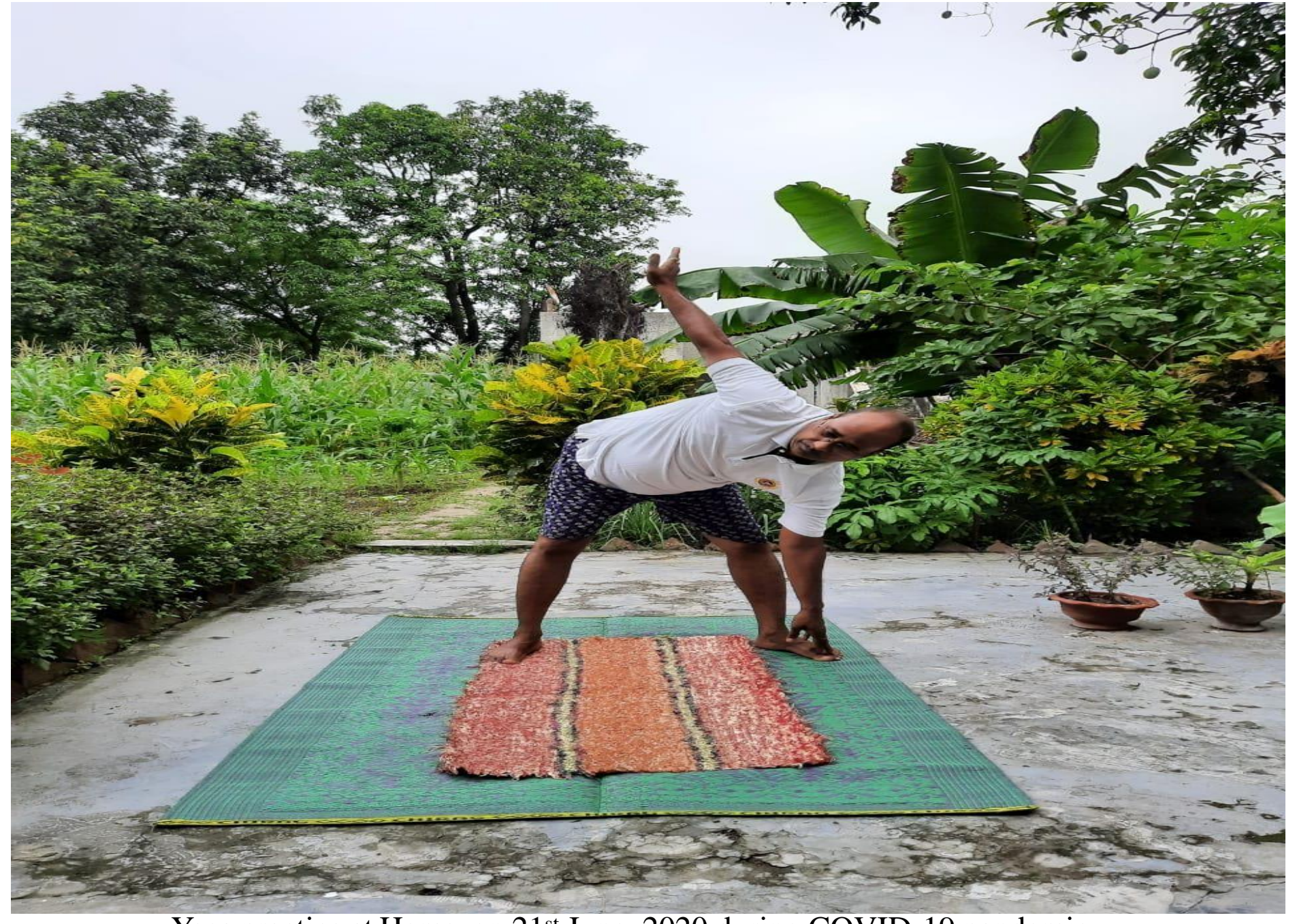
Yoga practice at Home on 21st June, 2020 during COVID-19 pandemic