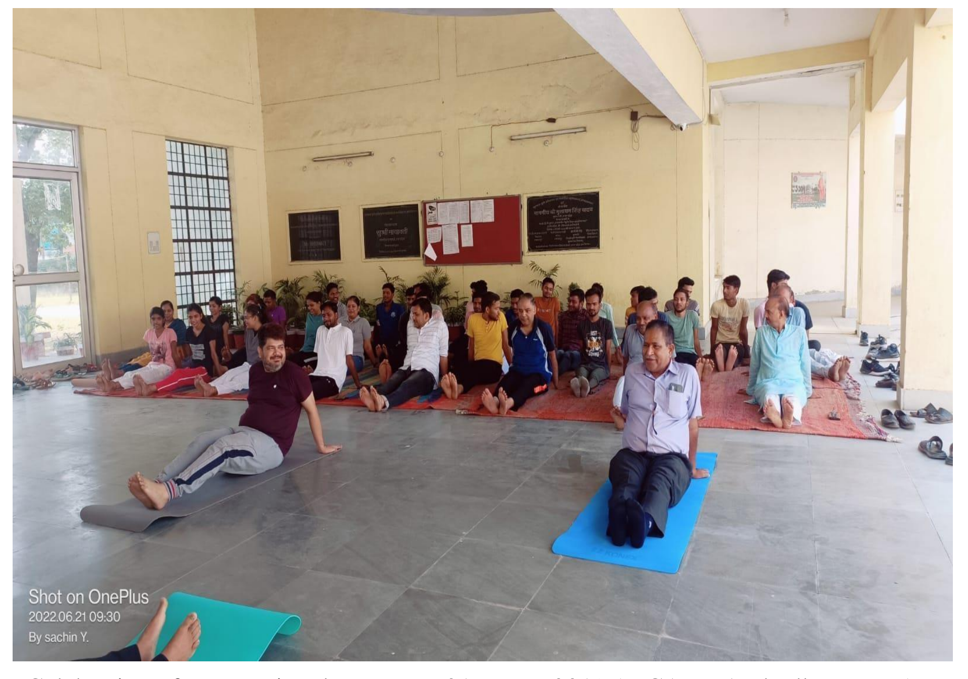
Celebration of International Yoga Day, 21st June, 2019 (MCAET, Ambedkar Nagar)