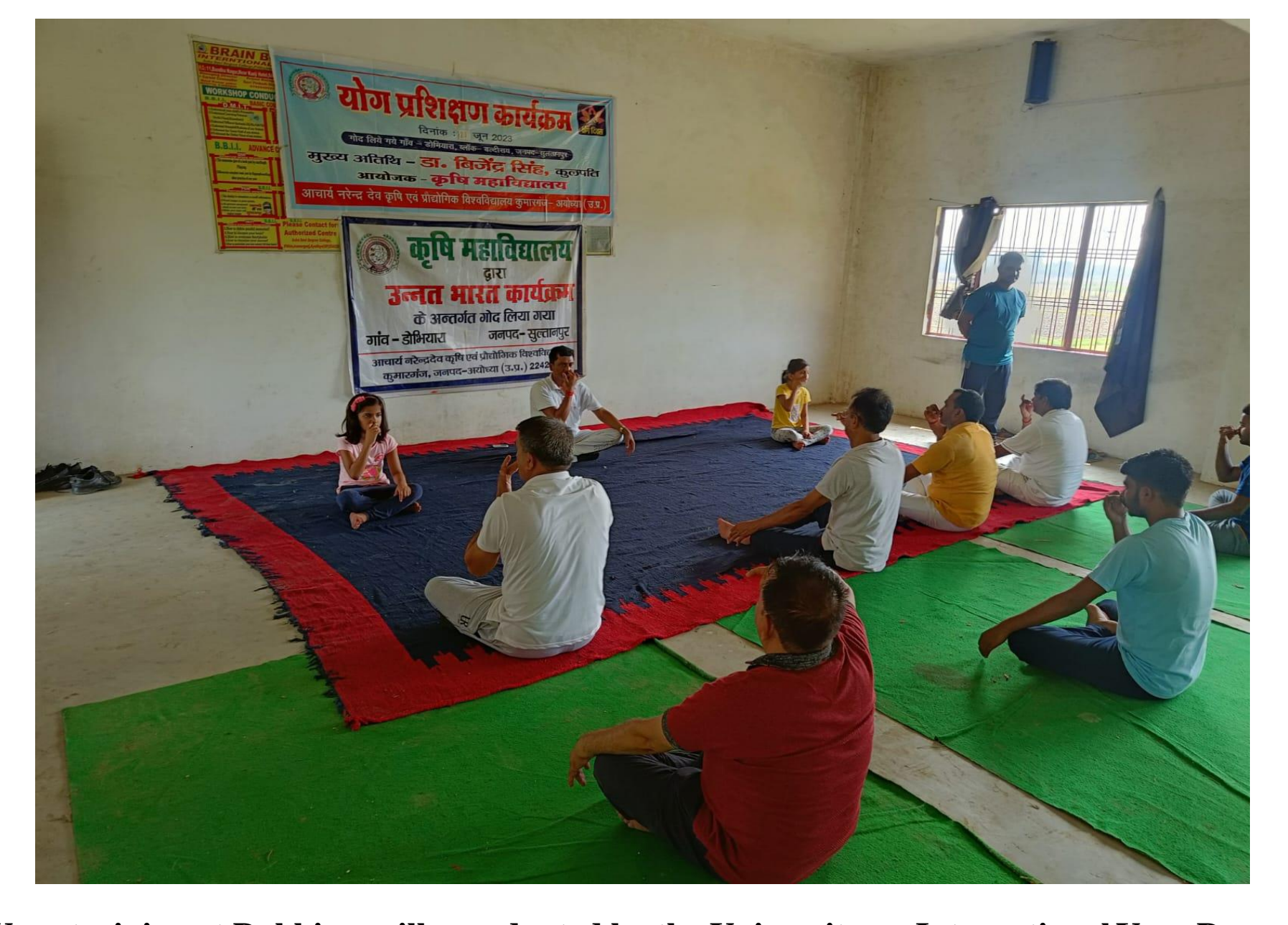
Yoga training at Dobhiara village adopted by the University on International Yoga Day