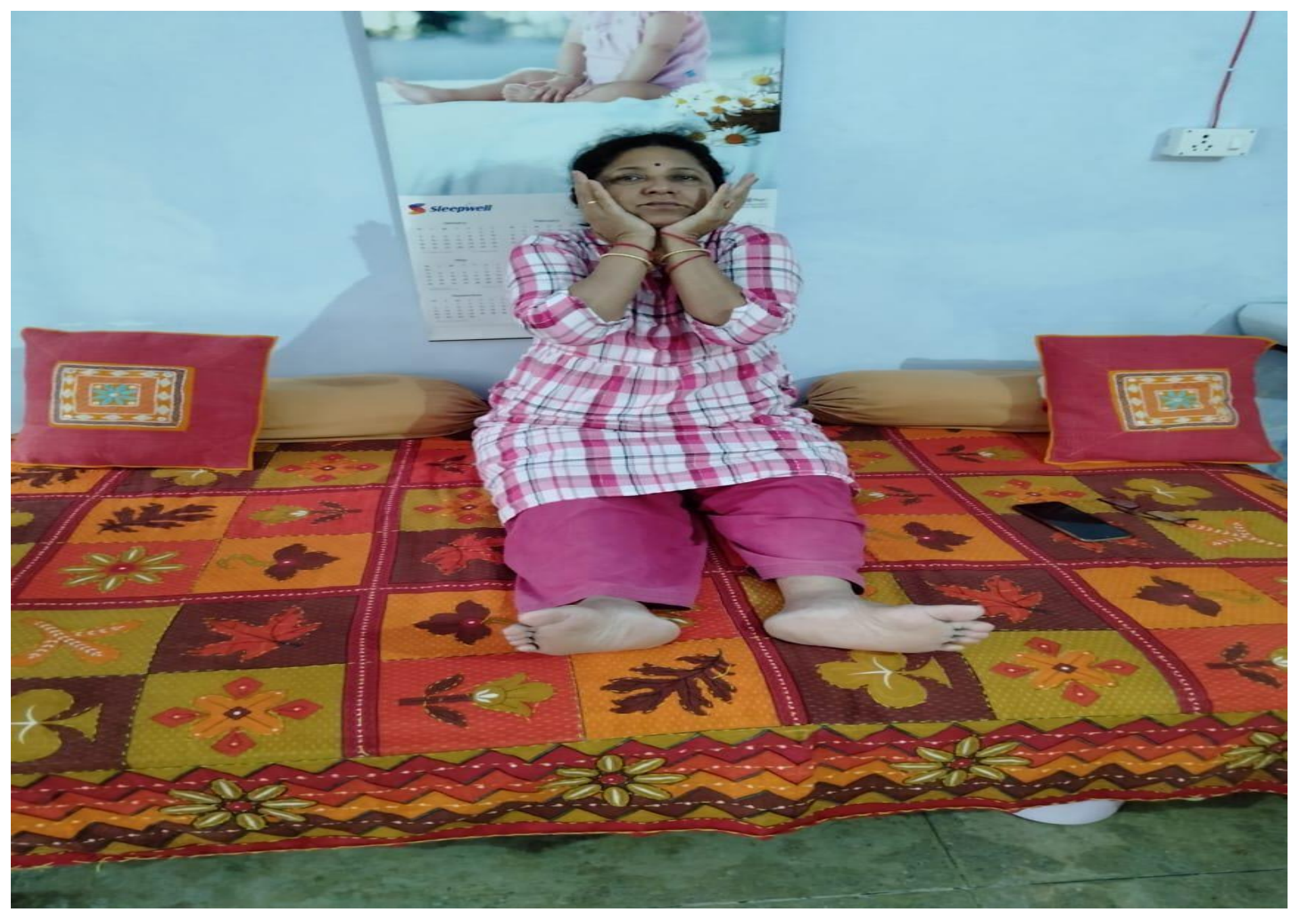
Yoga practice at Home on 21st June, 2020 during COVID-19 pandemic