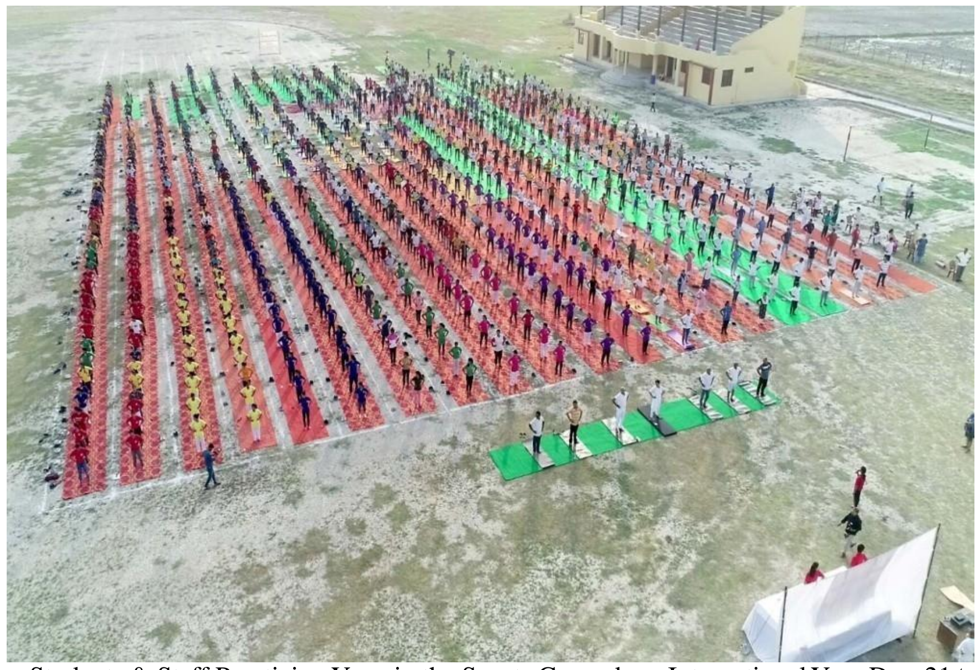
Students & Staff Practicing Yoga in the Sports Ground on International Yoga Day, 21st June, 2022