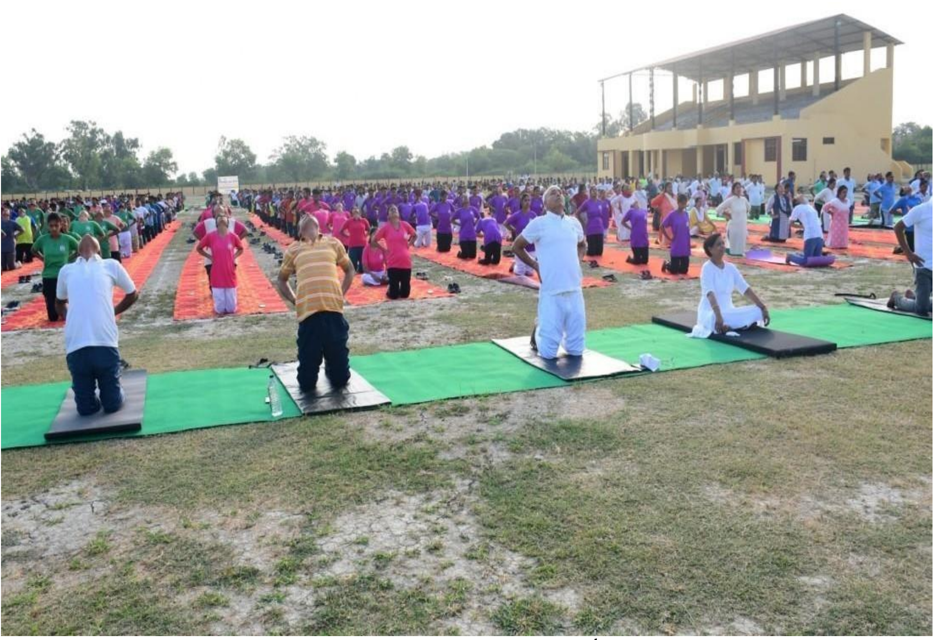
Performing Ustrasana Yoga on 20th June, 2022