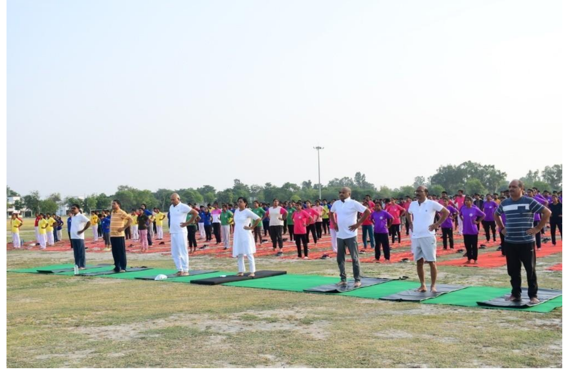
Students & Staff Practicing Yoga on International Yoga Day, 21st June, 2022