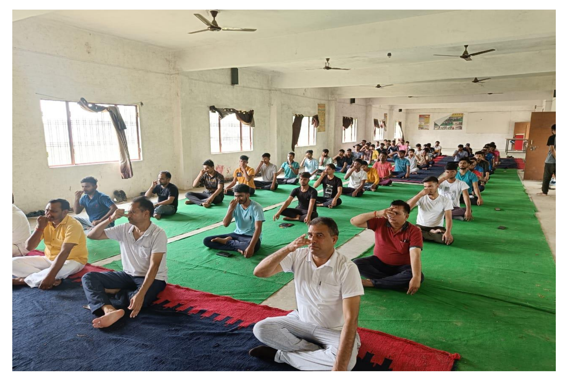
Yoga practice by the villagers of Dobhiara village adopted by the University on International Yoga Day