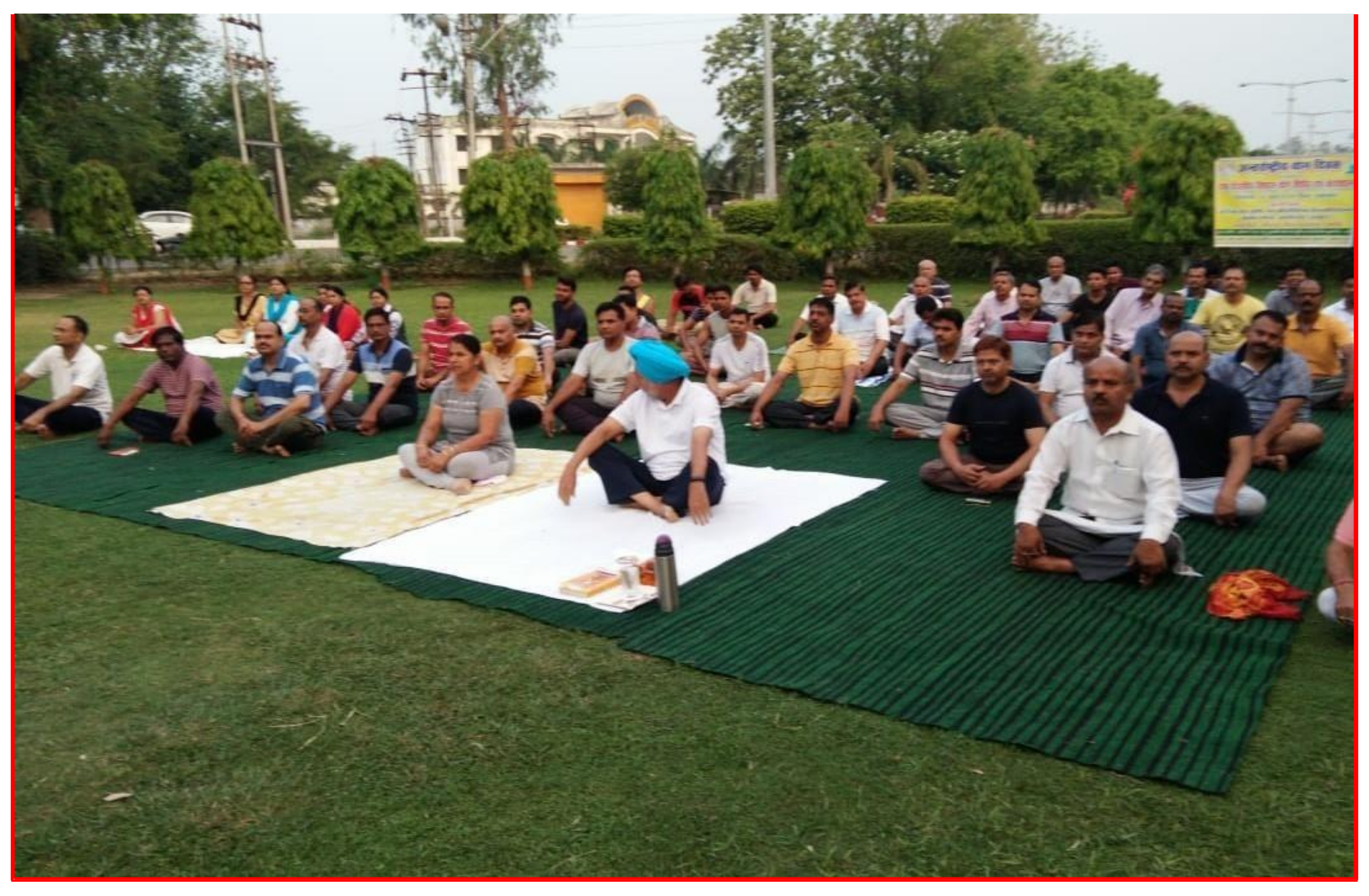
Yoga Preformed on International Yoga Day, 21st June, 2019