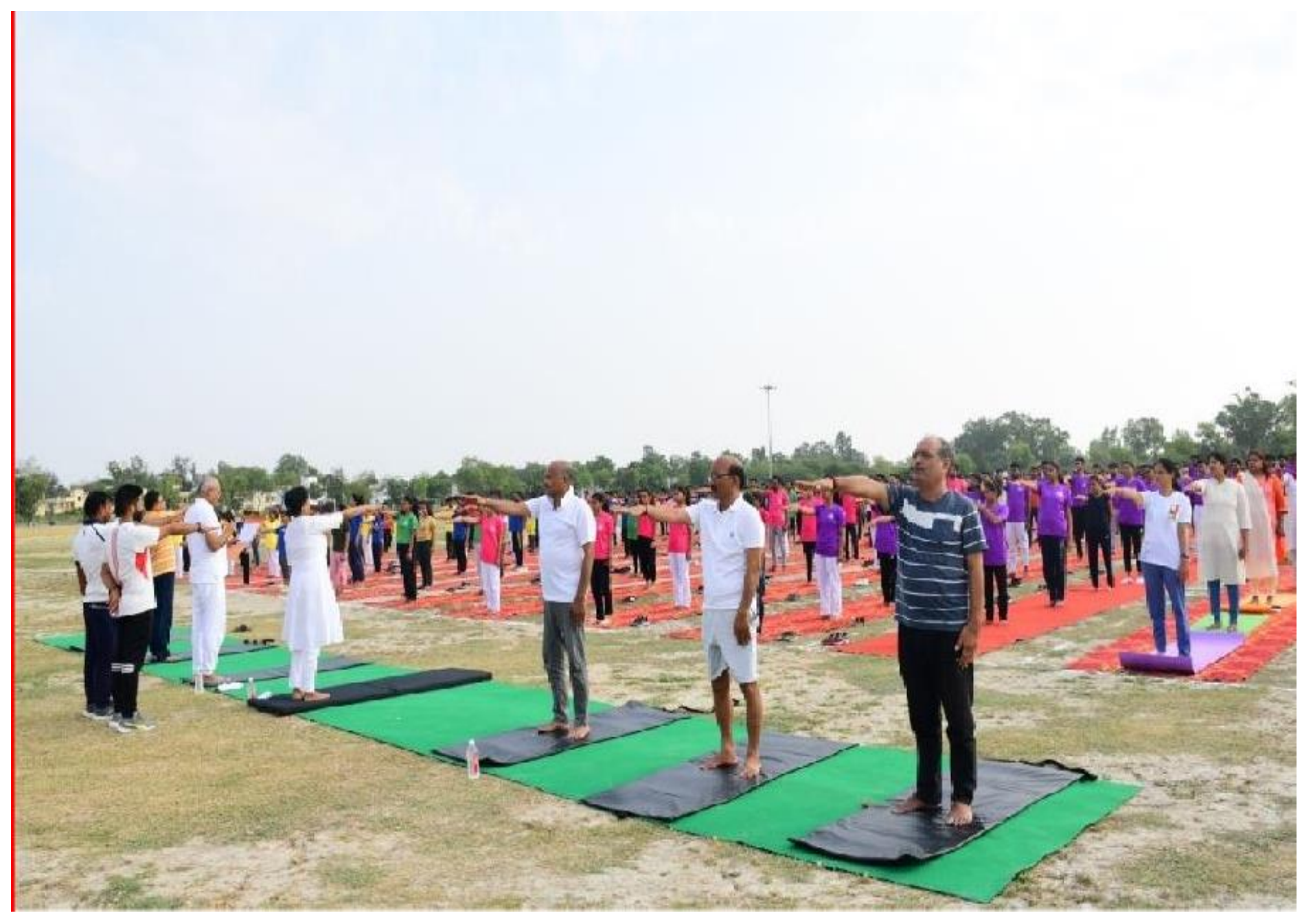
Pledge taking Ceremony during International Yoga Day, 21st June 2022