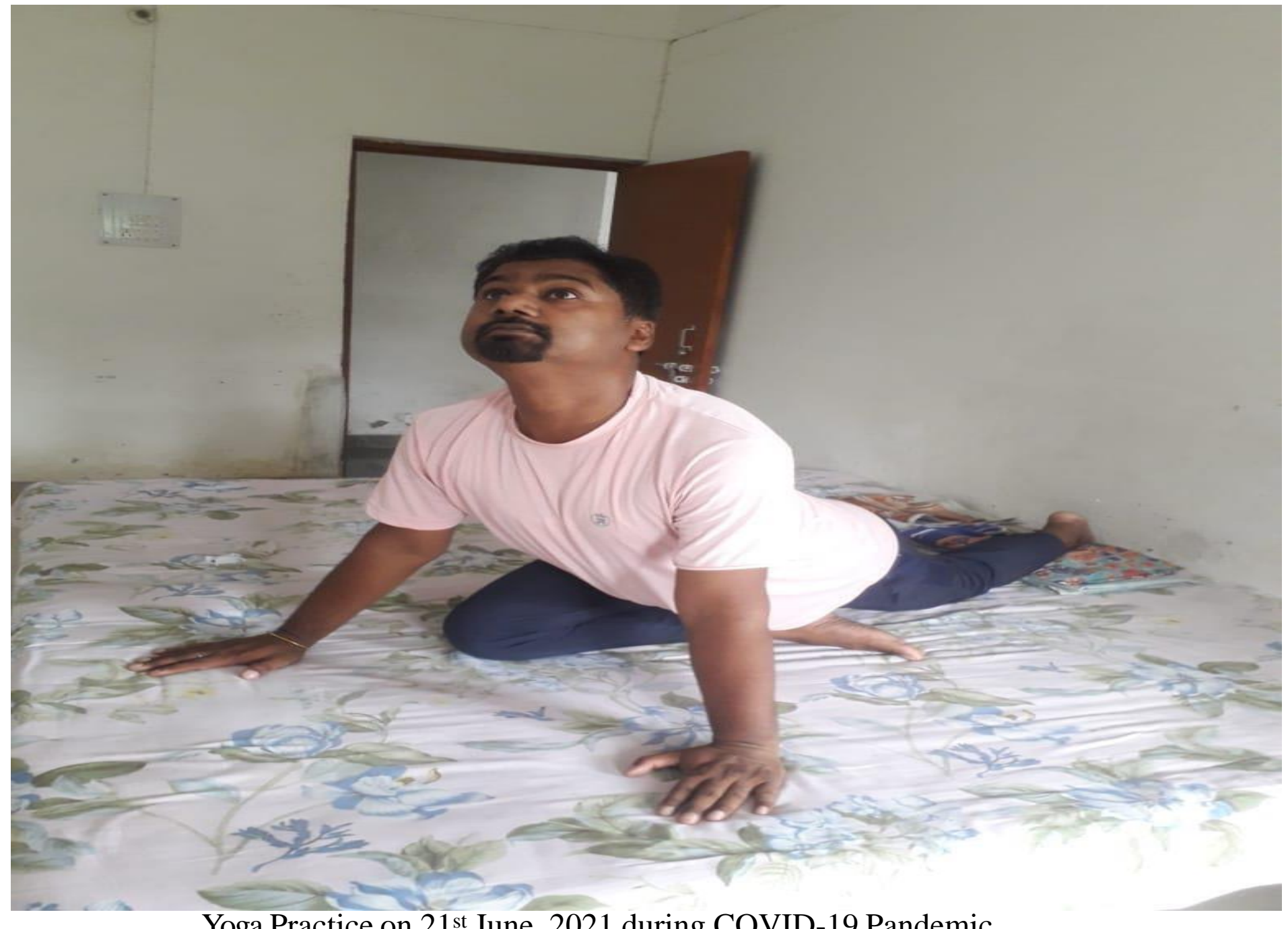
Yoga Practice on 21st June, 2021 during COVID-19 Pandemic