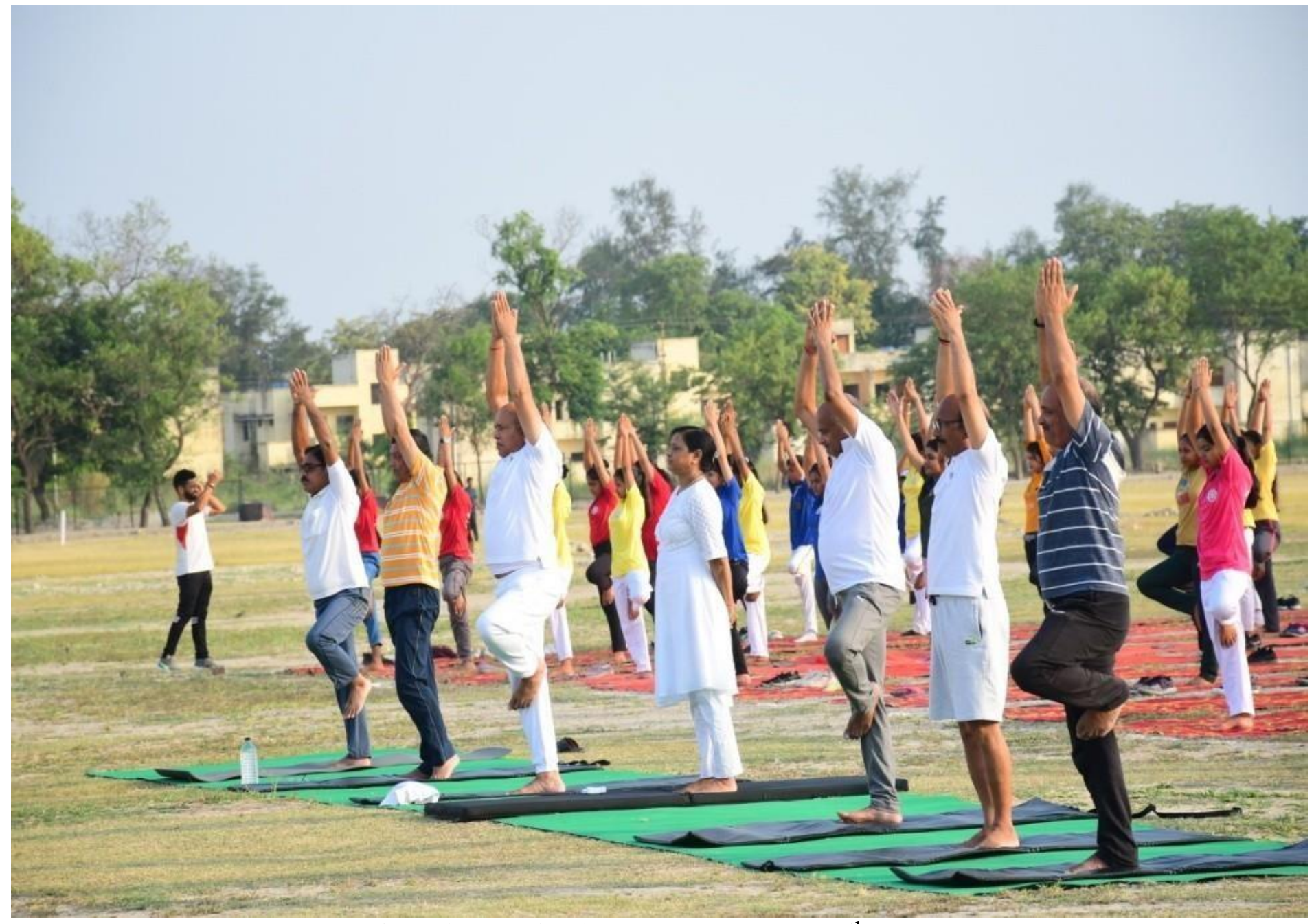
Performing Vrikshasana Yoga on 20th June, 2022